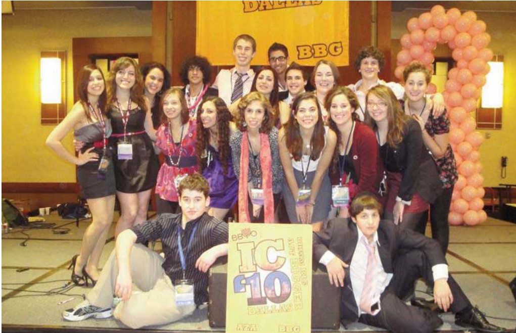
Nineteen Canadian delegates, who travelled from Toronto, Winnipeg, Calgary and Edmonton, were among 800 teens from eight countries attending the B'nai B'rith Youth Organization's International Convention in Dallas, Texas.

The weekend was originally headlined by the Day of Service, in which teen participants would disperse throughout Dallas to more than two dozen service sites, but plans changed due to inclement weather. Instead, the teens participated in an advocacy simulation, choosing an issue of importance about which to lobby 'Congress' and then find out whether they were success-