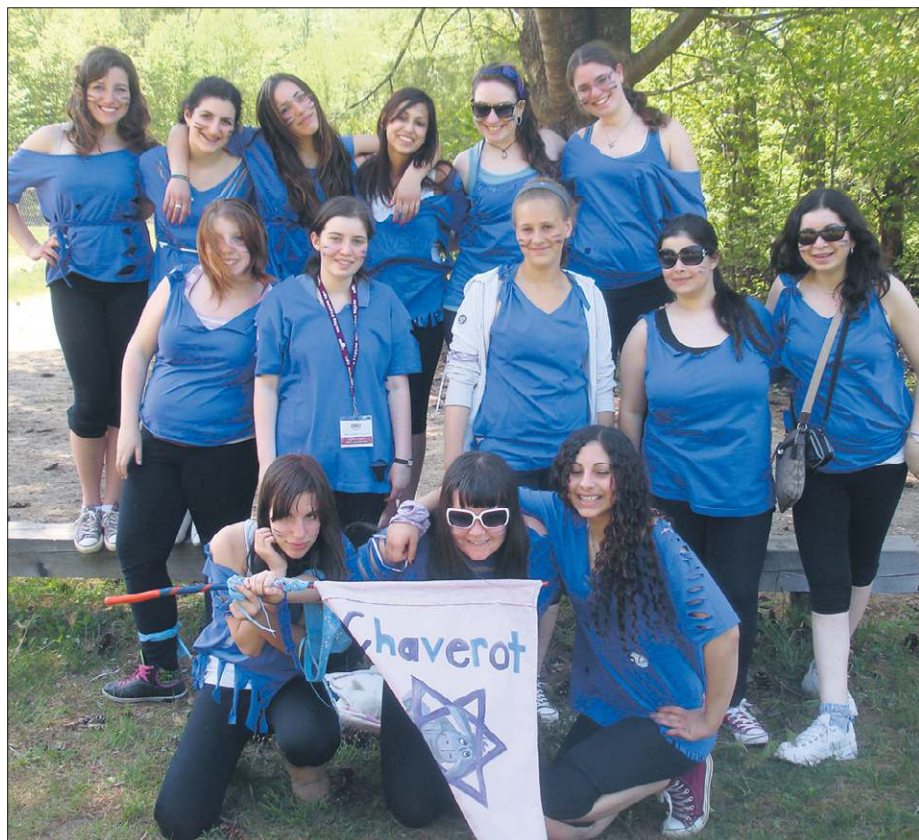
BBYO members at the recent spring regional convention at Camp Northland